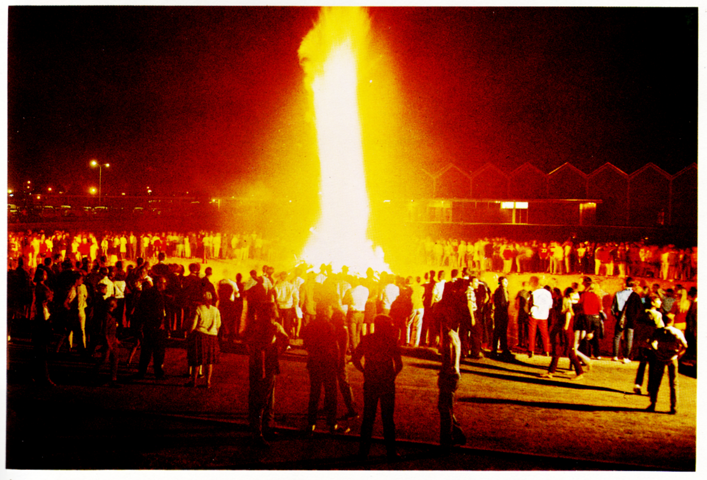
As a pepper-upper before the Homecoming game, a bonfire blazes the night of Oct. 20. After the Kofa King effigy, constructed by the Freshman Class, was devoured by the scorching flames, the excited observers received the true spirit of Homecoming and the true meaning of being a proud Coron-