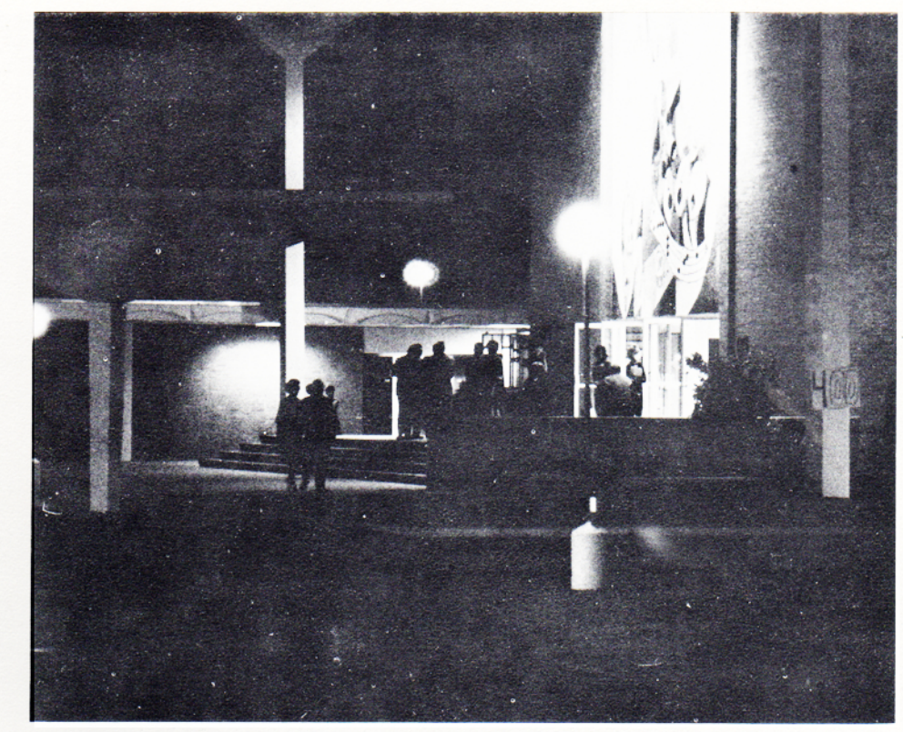
The sounds of silence permeates the still night at Coronado as Don's parents assemble in the auditorium for a brief introduction to Open House, held Nov. 1. The spotlight accentuates the structural decor of the 400 building mall and the auditorium entrance which greets visitors with the mosaic mural designed by Mr. Joseph Gatti. The concrete umbrellas and simple lamp posts act as guides through the mall.

Walls, gates, classrooms, plant designs, and the sights and sounds of school life complement CREATIVITY on campus.