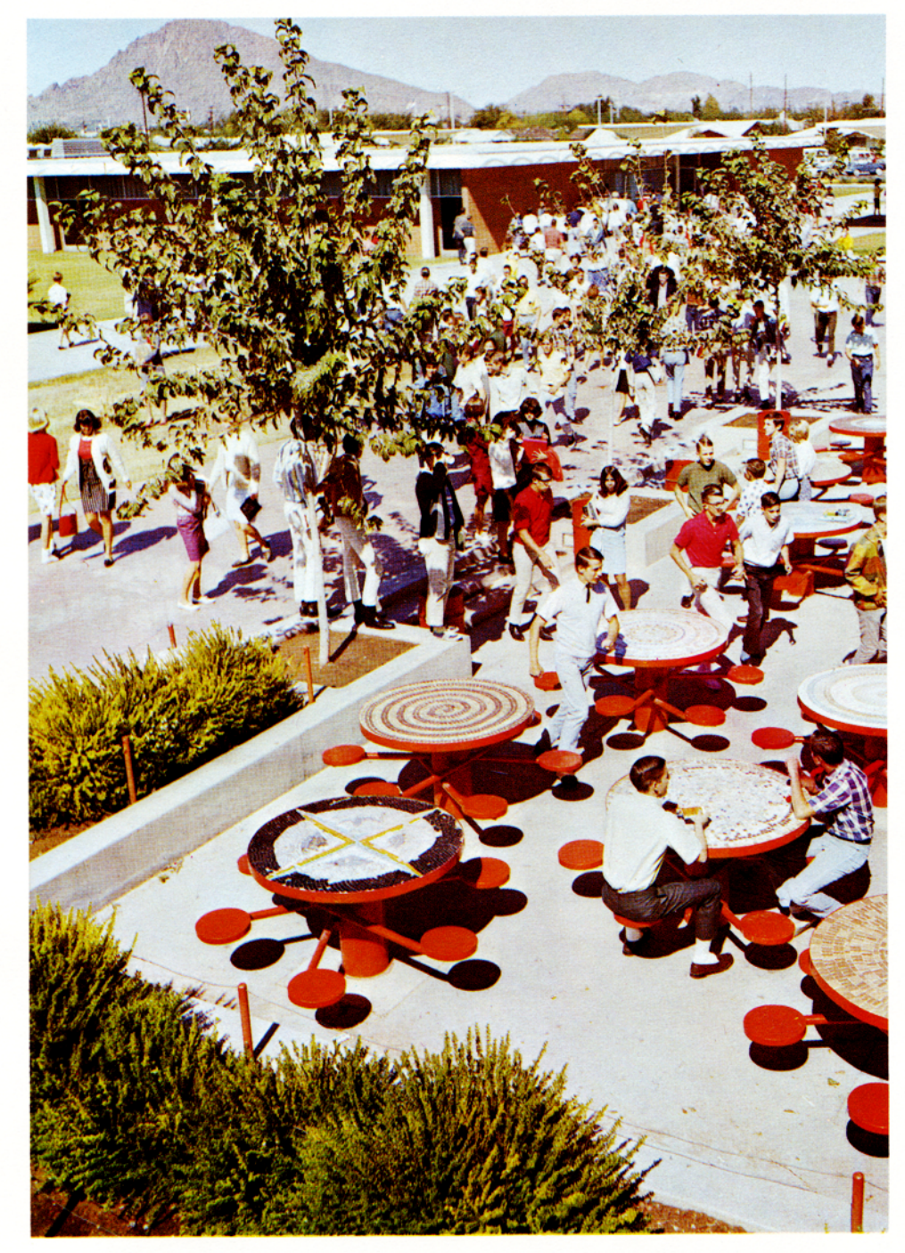
Cafeteria meals and snack bar delicacies await the starved students who dash out of the 100 building to be first in line. Scattered throughout the sunken snack bar area are the round, flashy orange tables, with mosaic patterned tops. The combination of color and designs brighten dreary days and add artistic flavor to the lunches.

A closer look at sections on campus exhibits many picturesque ornaments that usually go unnoticed by many bypassers. The top site is one of the four gates protecting the out-door lockers between the 400 and 500 buildings. The decorative wall that shades the south side of the cafeteria is illustrated by the second scene, and the third campus view displays the zig-zag borders, which dramatize the auditorium roof. The last Aztec design exemplifies the wall that adorns auditorium lobby.