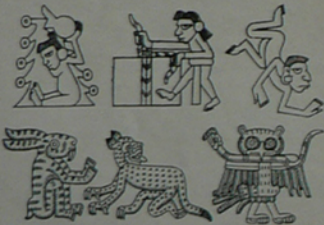
Human and animal motifs from Mixtec pictorial manuscripts. From a drawing by Covarrubias.

This beautiful book, illustrated by the author, presents the plastic arts of the aboriginal inhabitants of Mexico (including Yucatan), Guatemala, Belize, Honduras, El Salvador, and Nicaragua: the Maya, Aztecs, "Olmecs", Toltecs, Tarascans, Mixtecs and many others, including some rich cultures only recently brought to light.