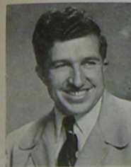
CENTRAL ARIZONA CHAPTER